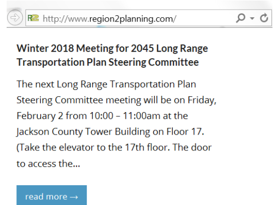
Figure 3-2 Project Website Meeting Announcement

Emergency Management, Natural Disasters and the Transportation System Chapter