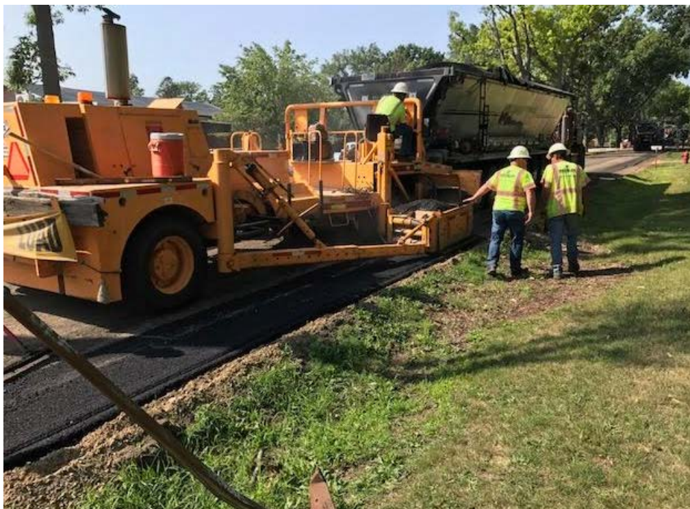
Paving the trenched areas on Robinson Road