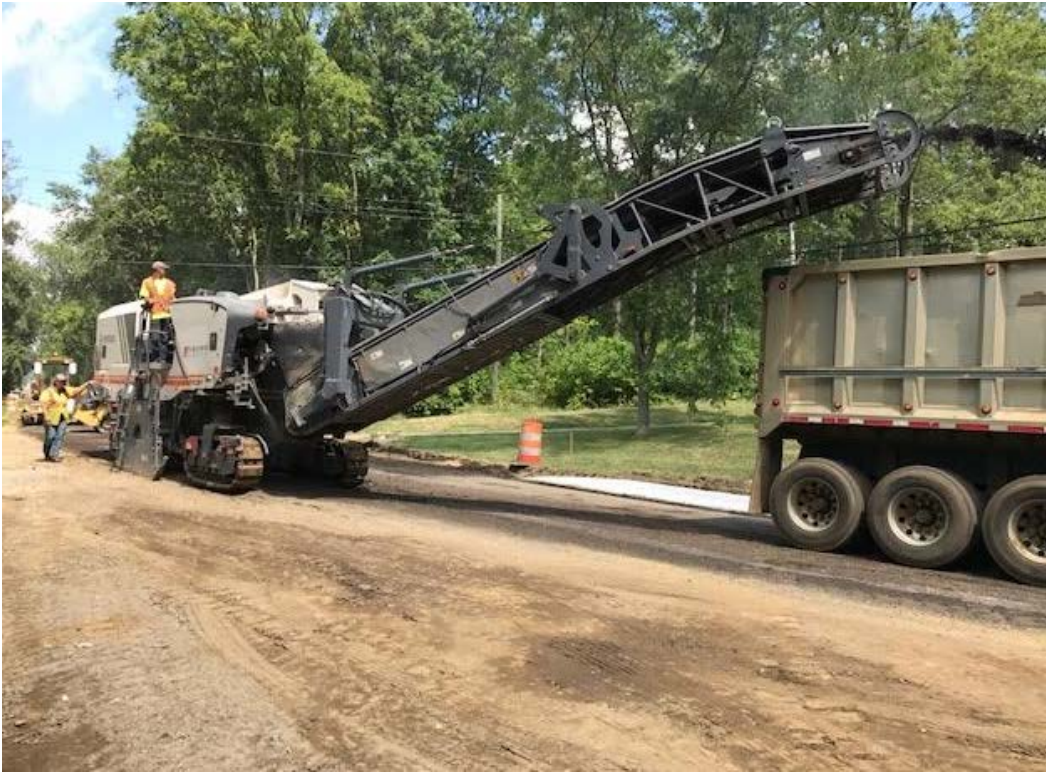
Milling Robinson Road