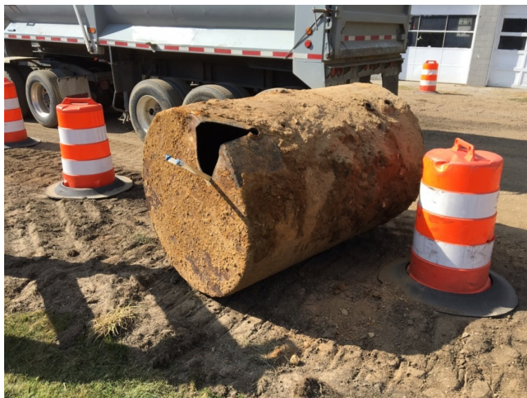
Tank Discovered on Coats Road