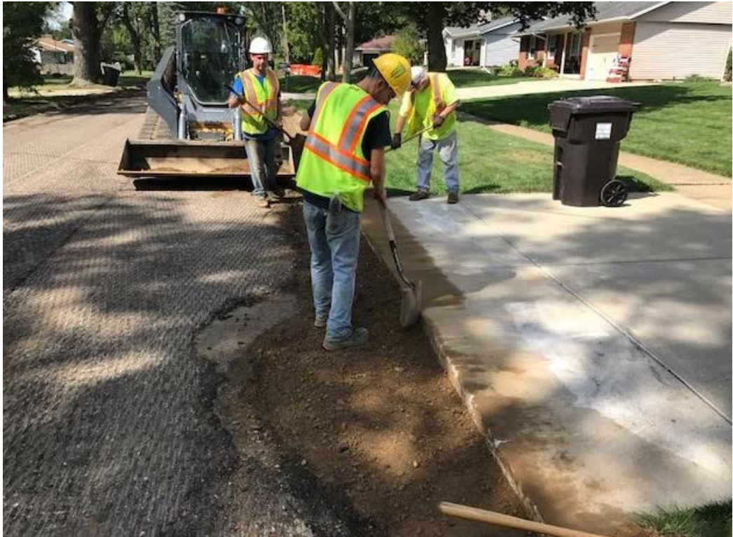
Prep work on the trenching areas on Robinson Road