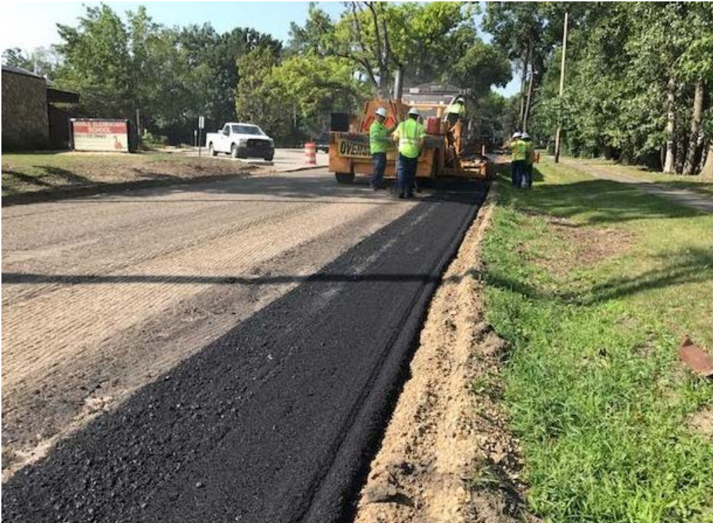
Paving the trenched areas on Robinson Road