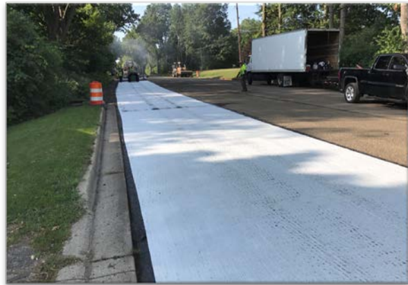
Robinson Road fabric work