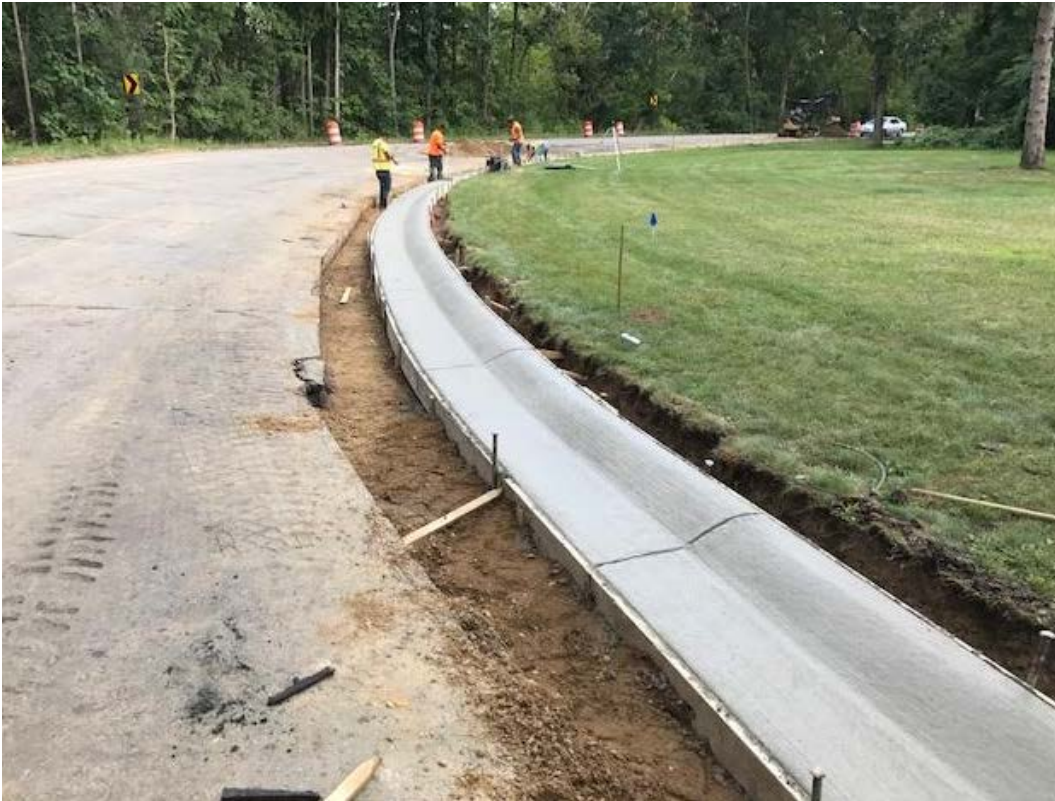
Pouring curb on Robinson Road