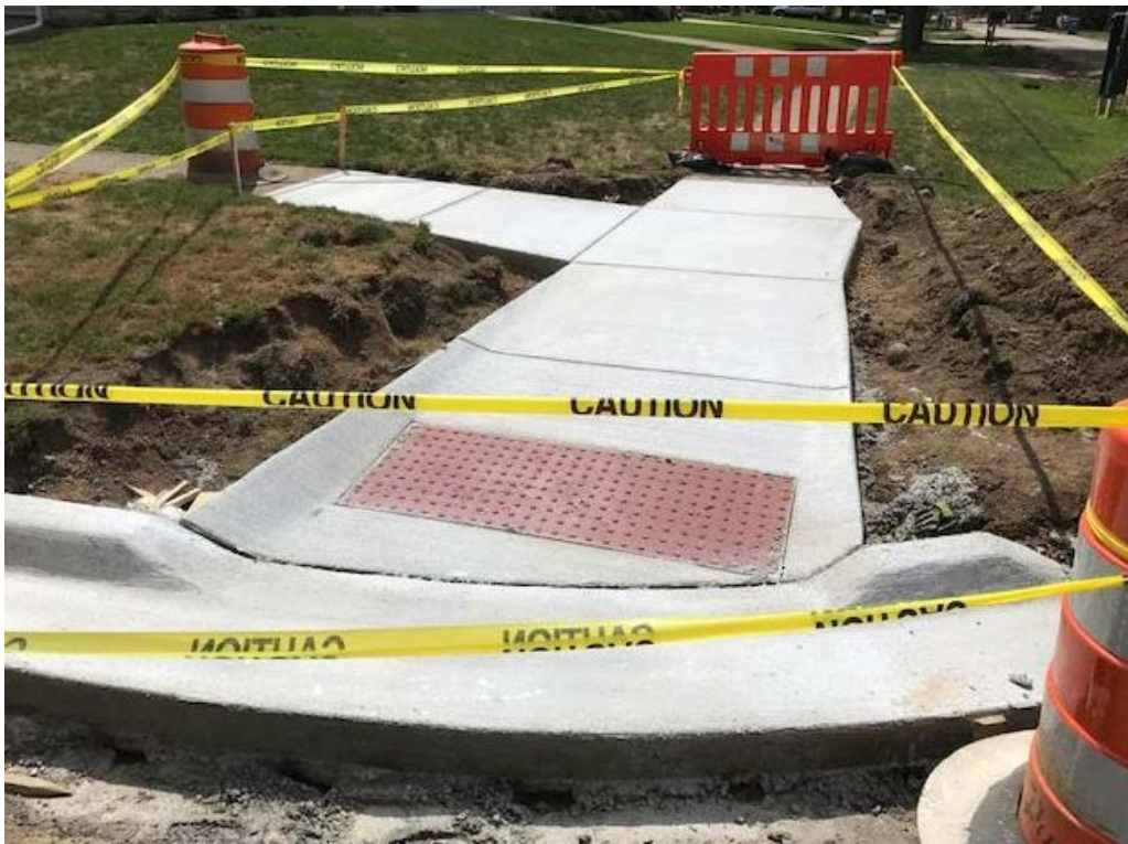
New ADA compliant sidewalk ramps on Robinson Road