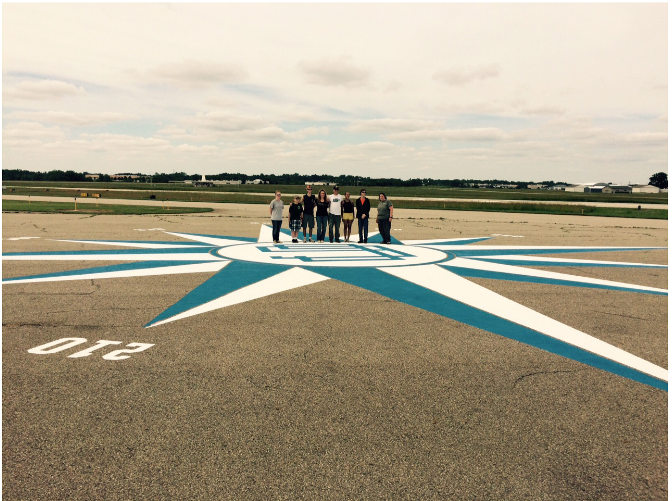
Compass Rose at JXN