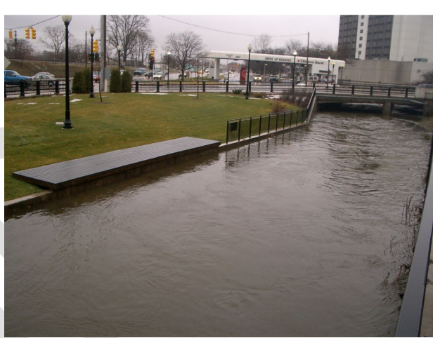
Figure 13-2 Flooded Grand River in Downtown Jackson

The intent is to give specific guidance that is applicable to most projects, and enable MDOT to practice good storm water management. MDOT University Region engineers use the manual as a starting point to ensure good engineering storm water management practice is used for state projects.