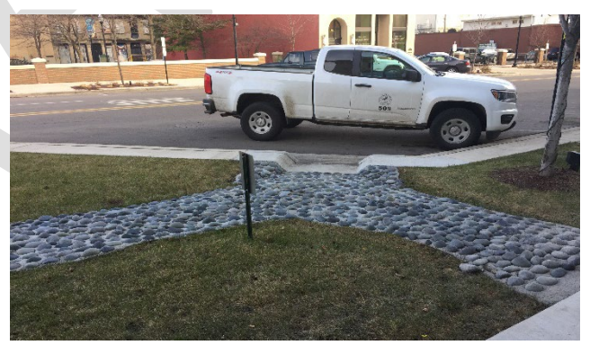
Figure 13-3 An Example of Storm Water Management in the City of Jackson

dealing with storm water for all transportation related projects that meet the minimum requirements.