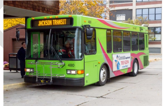
Figure 6-2 JATA Bus

The timeline for implementation of the national performance measures is determined when a final rule establishing the date for the rule is effective. Table 6-1 outlines the effective date of the final rule and when States and MPOs must take action.