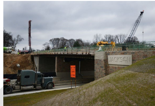
Figure 6-4 Cooper Street Bridge under Construction

MDOT submits statewide targets for the federal system performance measures. MPO's will have six months to either support the statewide targets or develop their own. MDOT is working with the MPO's to discuss the process and methods for setting the targets, and