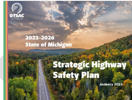
Figure 5-2 2023-2026 Strategic Highway Safety Plan

The 2023-2026 State of Michigan Strategic Highway Safety Plan (SHSP) was completed by the Governor’s Traffic Safety Advisory Commission in January 2023. Four emphasis areas were identified with the mission to “Apply the Safe System Approach through statewide strategies and initiatives that accommodate human mistakes and injury tolerance levels to move Michigan Toward Zero Deaths.” The overall vision of the document is to “Eliminate fatal and serious injury crashes on Michigan’s roadways” with the specific goals of eliminating the state crash fatalities from 1,131 in 2021 to 0 by 2050 and eliminating serious injuries from 5,979 in 2021 to 0 by 2050. Data from the Office of Highway Safety Planning shows an upward trend in fatalities and a downward trend in serious injuries. Deaths in 2021 were up 10.02% since 2017 however, incapacitating injuries were down 1.73% in 2021 since 2017.