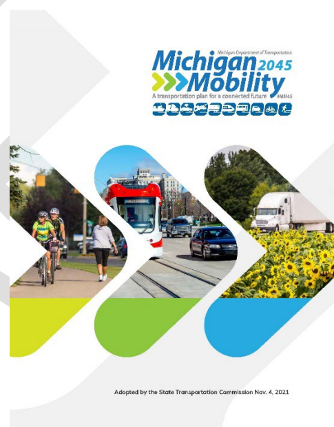
Figure 5-1 Michigan Mobility 2045 Plan

The transportation planning process historically defines goals and objectives, identifies problems, generates and evaluates alternatives, and develops short and long term plans. The Michigan Mobility 2045 Plan identifies six goals based on input from MDOT, stakeholders, public comments, national goals, and federal planning factors. Each goal is accompanied by measurable, outcome-based objectives that describe what must be done to achieve the goal and advance the MM2045 vision.