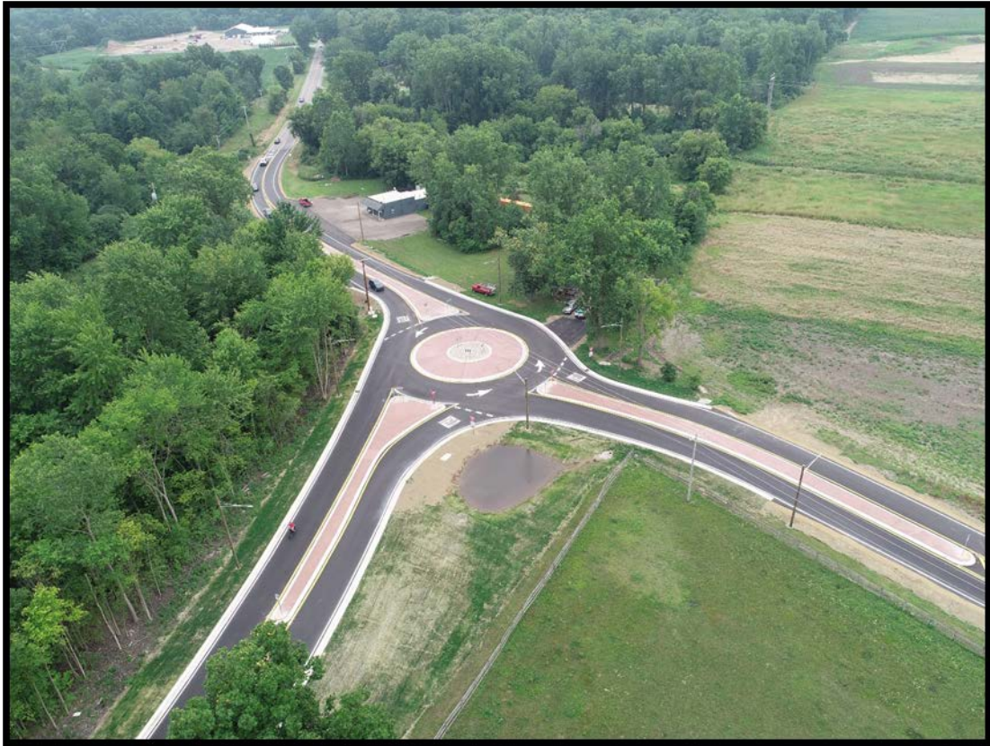
Springport and Rives Junction Roundabout