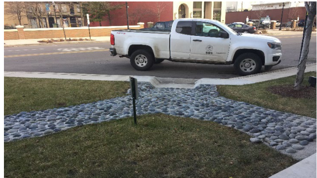
Figure 13-6 An Example of Storm Water Management in the City of Jackson

The previously mentioned 2016 City of Jackson Community Master Plan sites the need to address storm water runoff, especially in the downtown and urban core of the community, which includes maintaining an open and working transportation system. The City of Jackson is also part of the Upper Grand River Watershed Alliance.