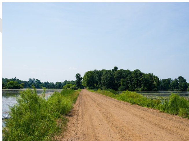
Figure 13-1 Watkins Lake State Park

The purpose of the analysis is to identify the projects that may have the potential to impact an environmentally sensitive area. Once a potential impact has been identified, general guidelines can be introduced for agency consideration during all phases of project planning, design, construction, and maintenance. Natural and Agricultural, Aquatic, and Cultural resource maps are shown on the next three pages. Buffers of a quarter of a mile were established around each proposed capacity improvement project. The proposed projects and their buffers were then overlaid on a series of maps identifying the locations of the following natural and cultural resources. The maps 13-1 – 13-3 are on the next three pages.