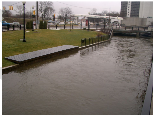
Figure 13-5 Flooded Grand River in Downtown Jackson

The intent is to give specific guidance that is applicable to most projects, and enable MDOT to practice good storm water management. MDOT University Region engineers use the manual as a starting point to ensure good engineering storm water management practice is used for state projects.