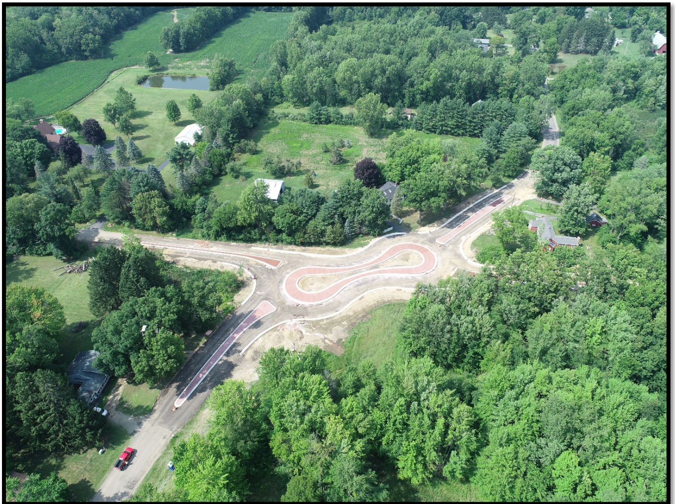
McCain and Dearing "Peanut" Roundabout

As of now, we are targeting the first week of September for the tentative completion of the project.