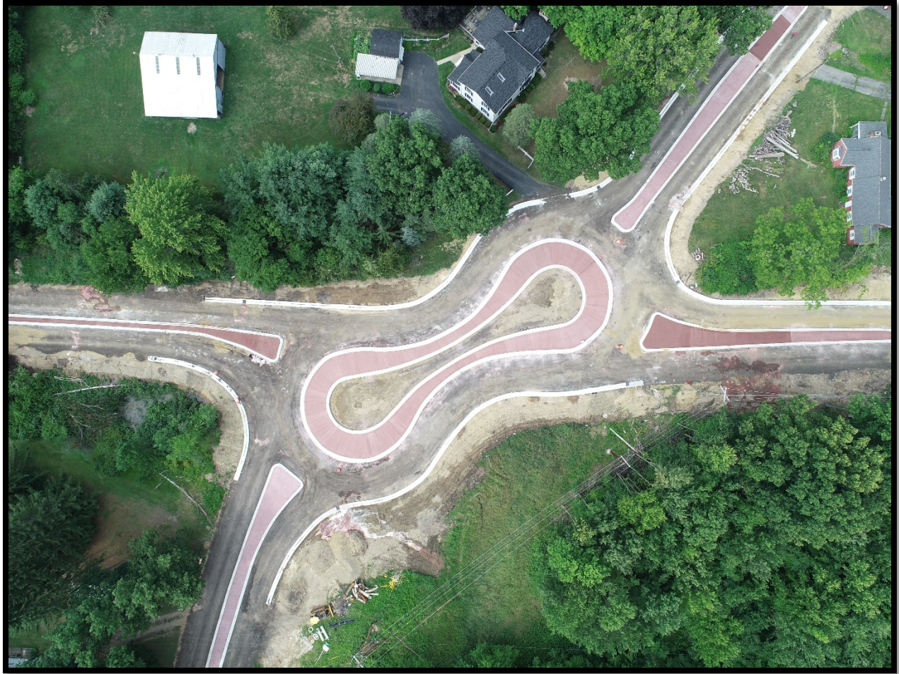
McCain and Dearing "Peanut" Roundabout

JN 211779 Countywide Horizontal Curve Signing (West and Northeast) – CONSTRUCTION