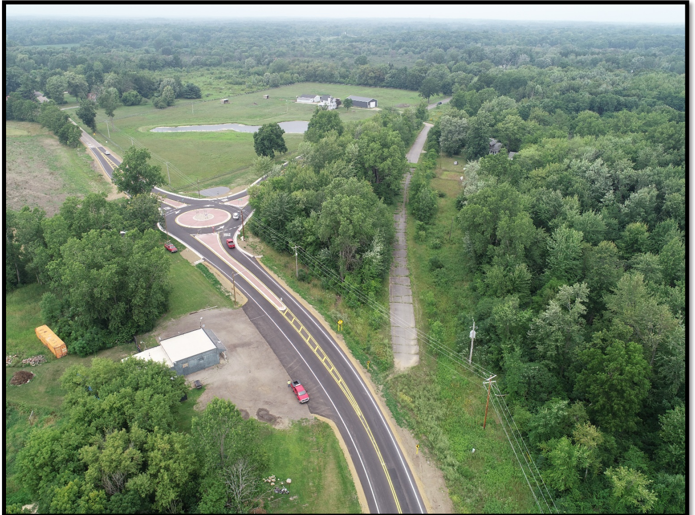
Springport and Rives Junction Roundabout