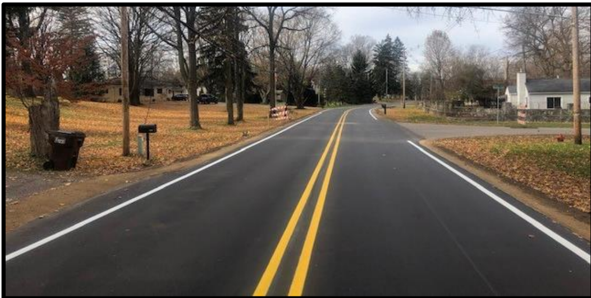
McCain Road – Cold-in-Place Recycling Operation

Construction began on McCain Road at the end of September. All work on McCain Road, with the exception of slope restoration, was in mid-November.