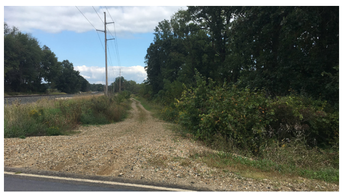
Consumers Energy corridor along active railroad between Parma and Albion