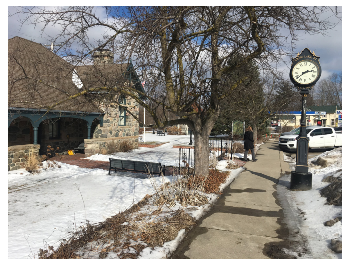
Whistlestop Park Depot in Grass Lake