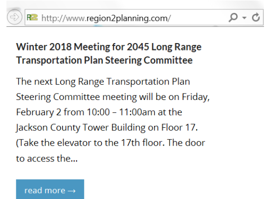
Figure 3-2 Project Website Meeting Announcement

Emergency Management, Natural Disasters and the Transportation System Chapter