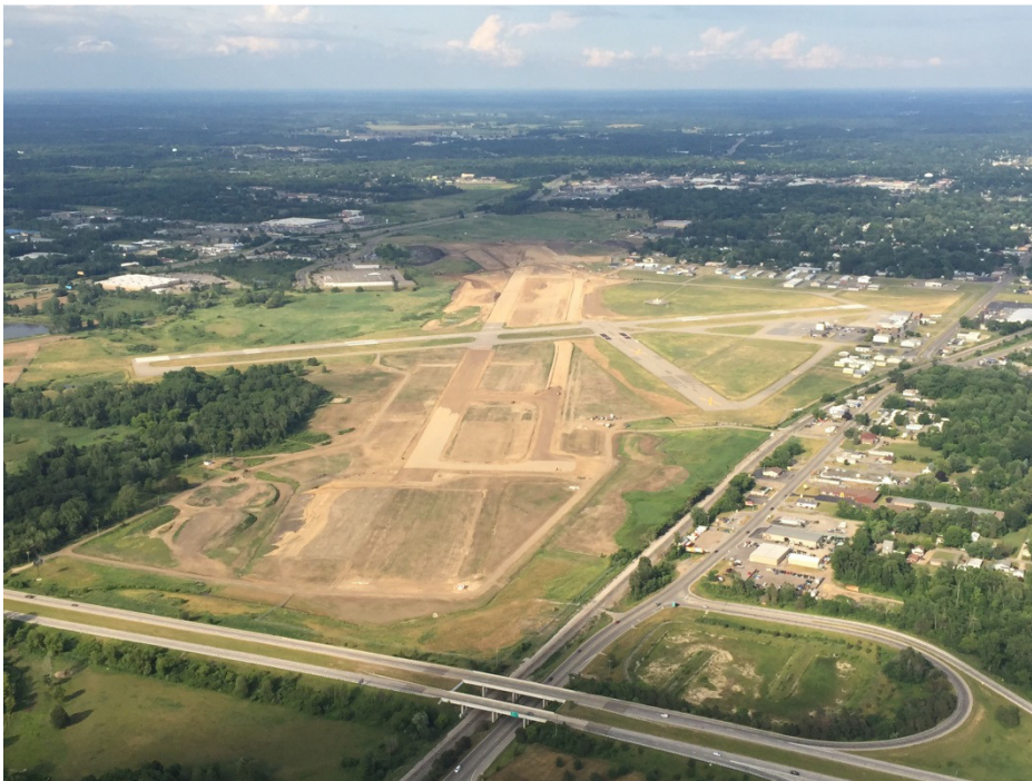
Treatment of wet sub base soils