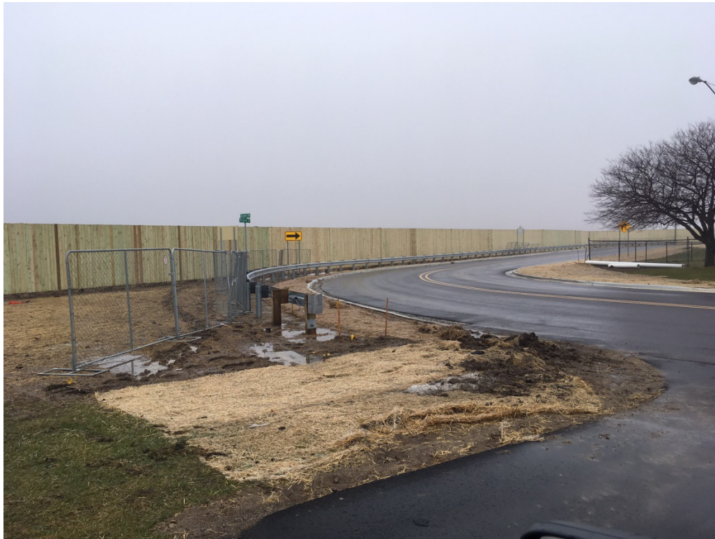
Airport-Argyle and Blast Fence