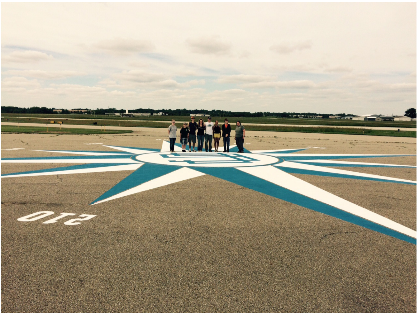
Compass Rose at JXN