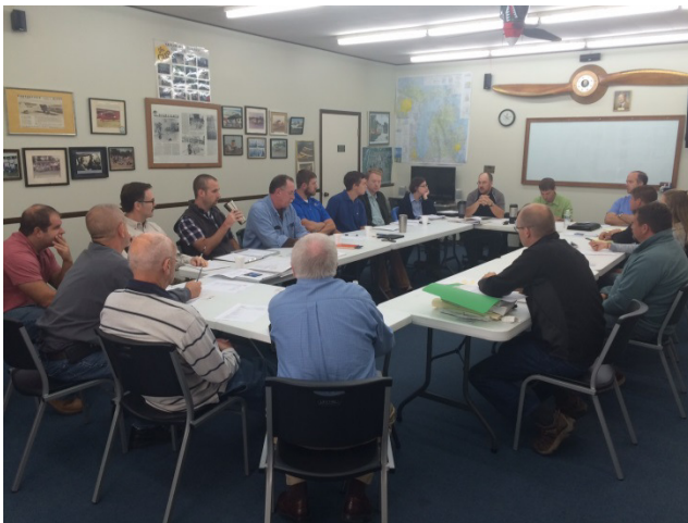
Pre-construction meeting Runway 7-25 Phase I