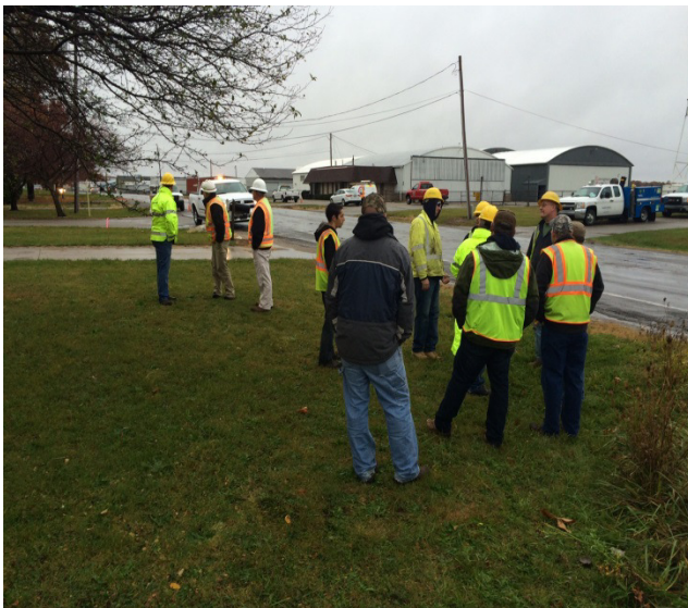
Airport-Argyle relocation utility contractor meeting